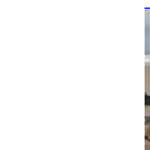
Florida's Shoreline Treasures 4/9/2008