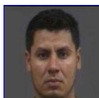
Woman raped at knife-point in Chesterfield 1 day ago